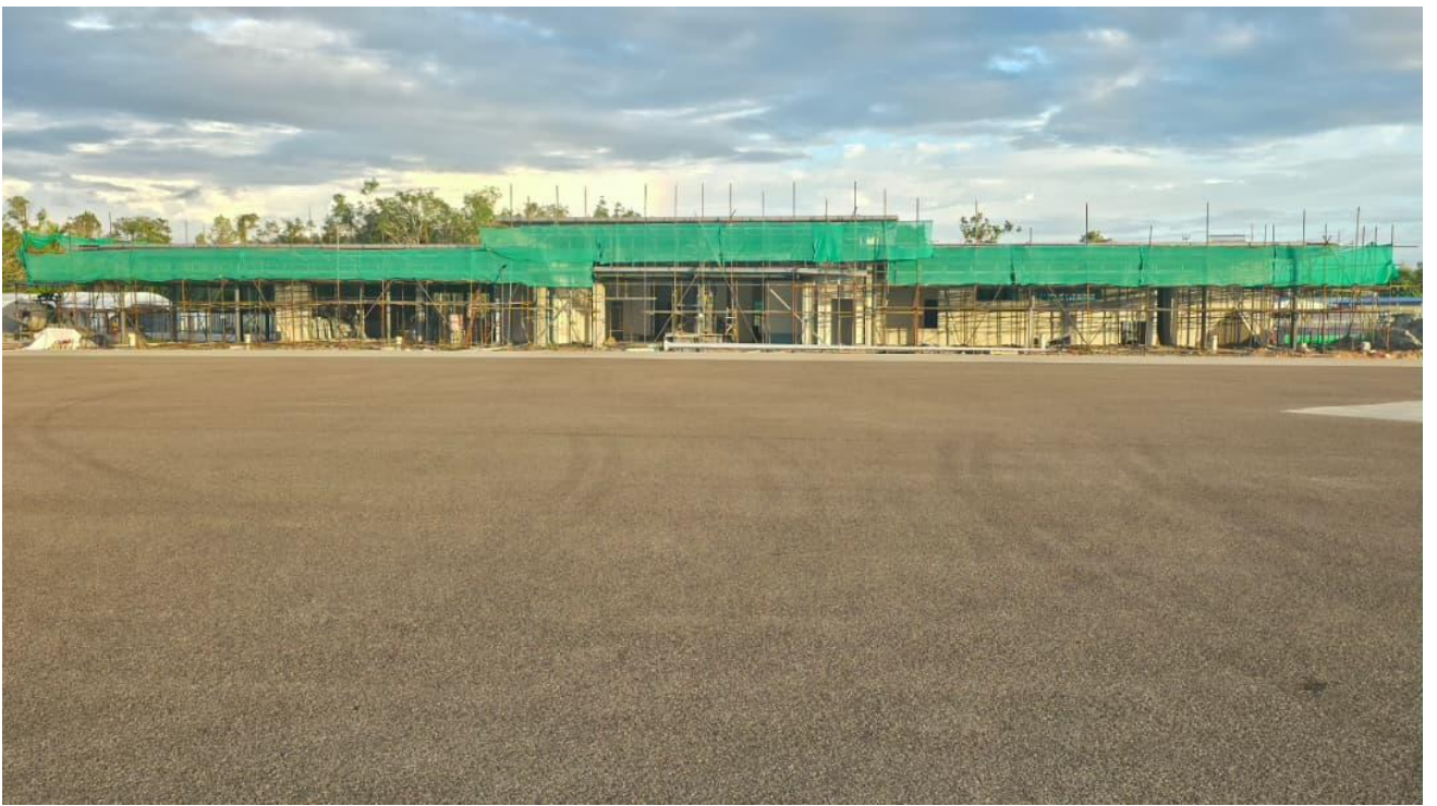
Caption: Terminal Building Super Structure completed whilst finishes are being progressed.