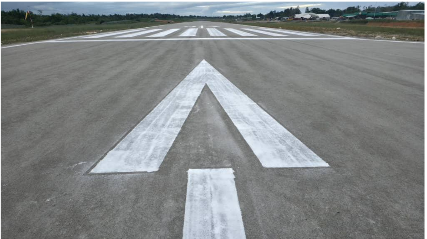
Caption: Temporary Line markings in progress on Stage 1 to 6 of the runway pavement works.